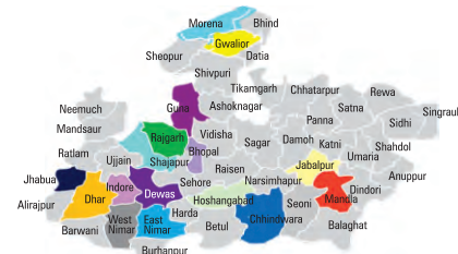
Map of Madhya Pradesh Depicting Textile Areas

Easy Connectivity · Amazing Incentives · Pro-active Policies